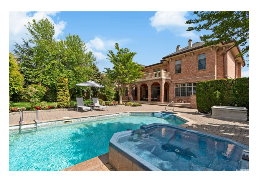
5 CENTER DRIVE