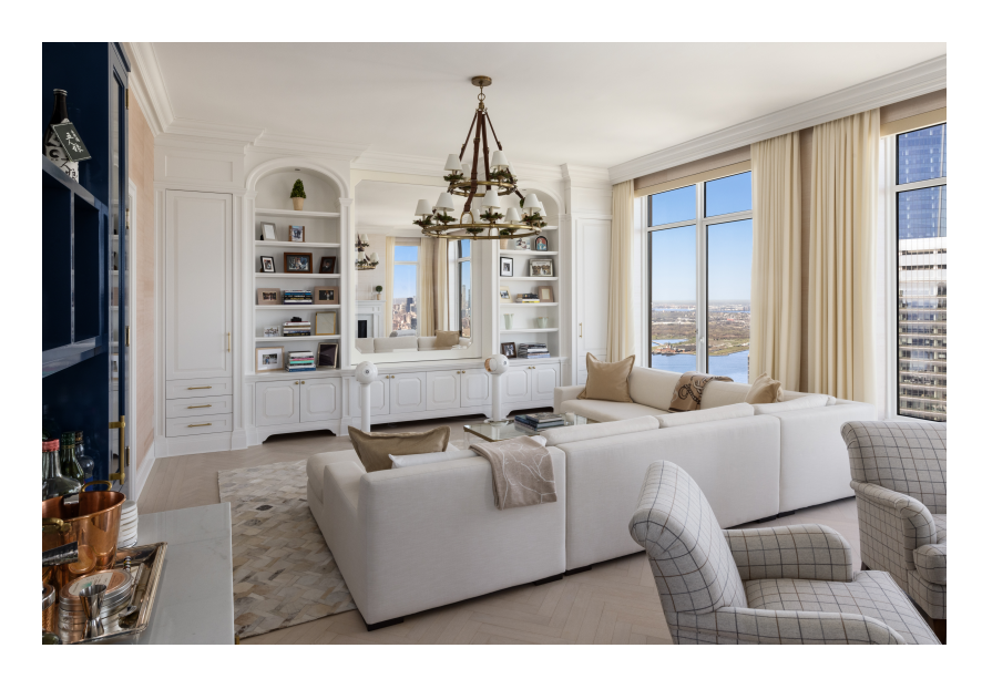
30 PARK PLACE #67A