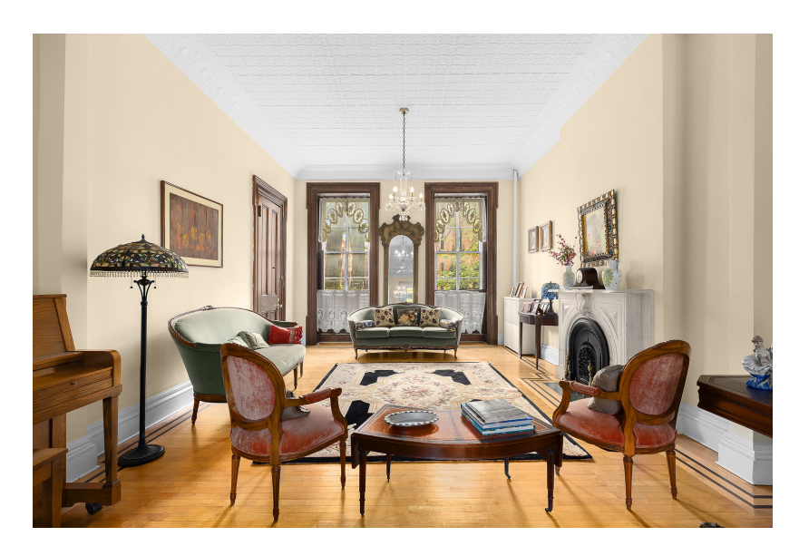
144 BALTIC STREET