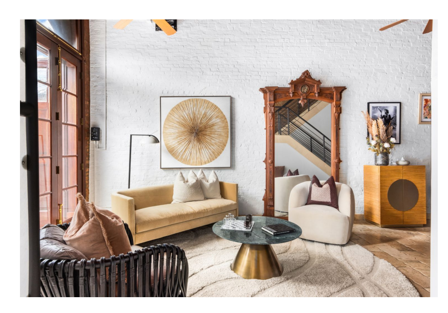
413 DEGRAW ST