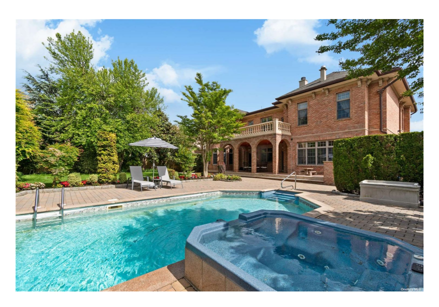
5 CENTER DRIVE

RESIDENTIAL CONTRACTS $1.25 MILLION AND UP