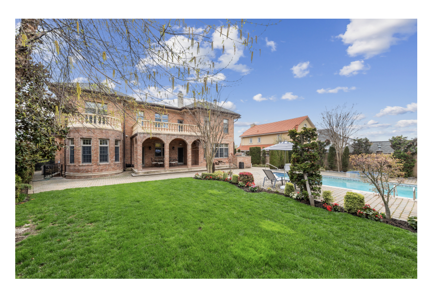
5 CENTER DRIVE

RESIDENTIAL CONTRACTS $1.25 MILLION AND UP