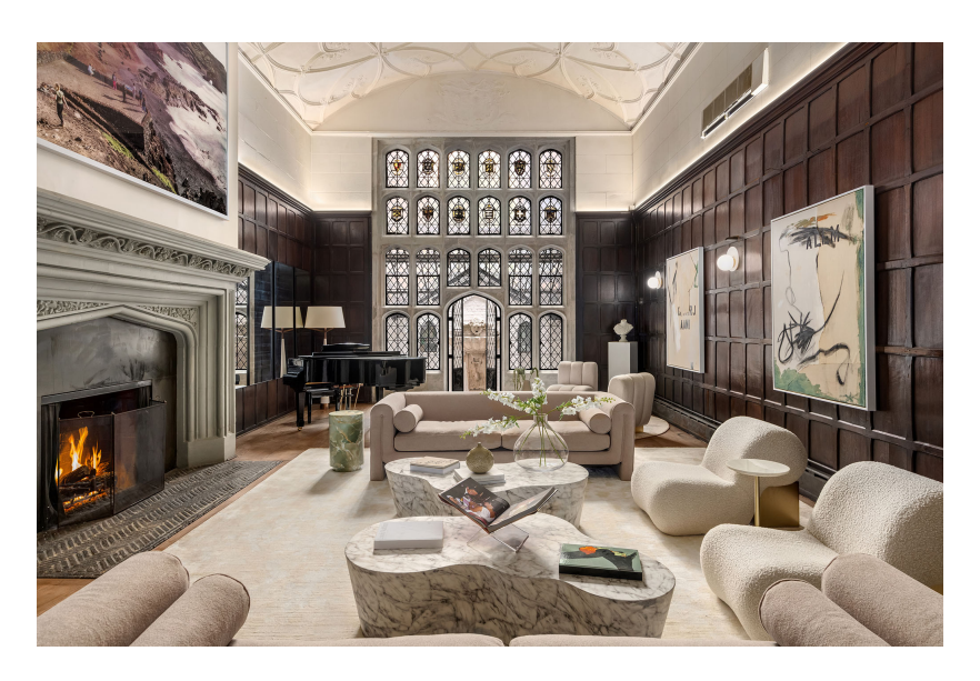
135 EAST 19TH ST