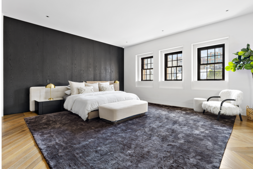
443 GREENWICH ST #PHB